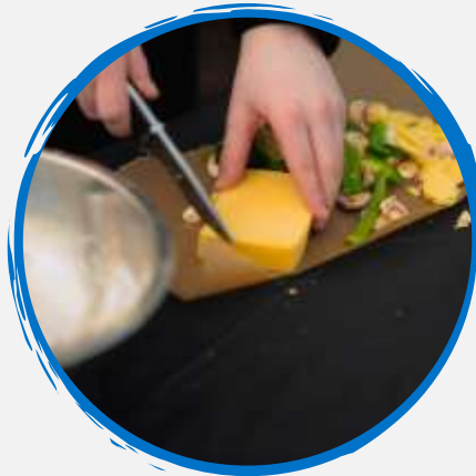
YOUTH & HEALTHCARE