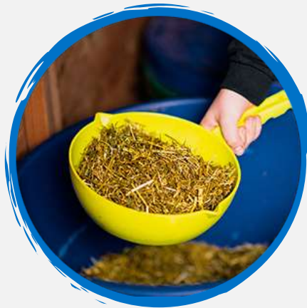
ANIMAL CARE AND MANAGEMENT STUDIES